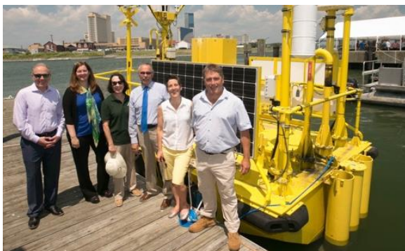
Deploying New Jersey's FLiDAR