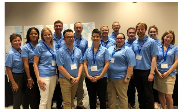
Public Open Houses