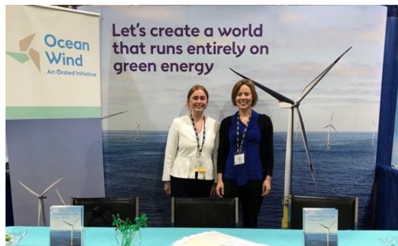
American Fisheries Society