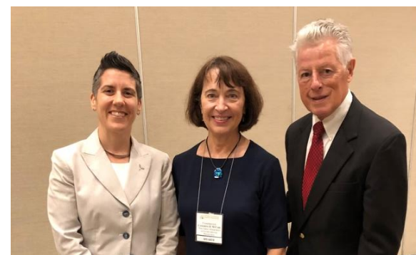
Meeting with Key Stakeholders