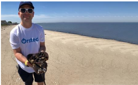
Horseshoe Crab Program