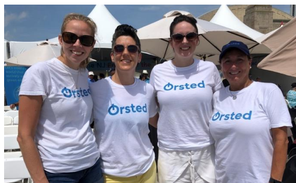
Atlantic City Air Show